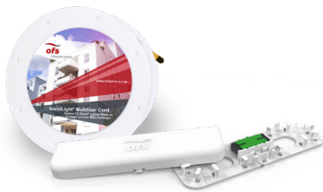
InvisiLight® MDU Cord and Compact Point of Entry Modules (in Risers and Hallways)